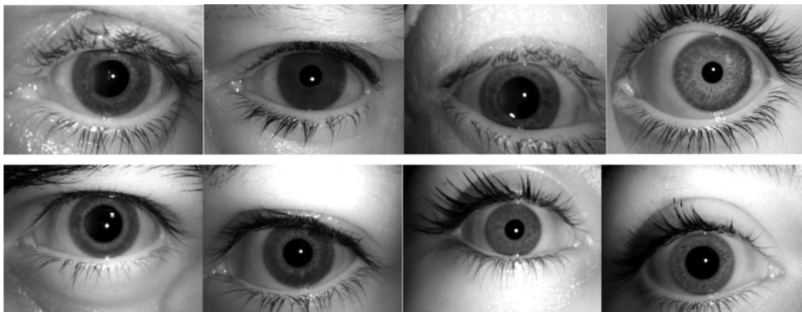
Figure 1: First row: diabetic eyes, second row: healthy eyes – captured by mono-ocular Iri Shield USB MK 2120U [18].

Despite diabetes diagnostic techniques which need just a small part of iris texture's region, for iris recognition purposes the overall structure of the iris must be segmented.